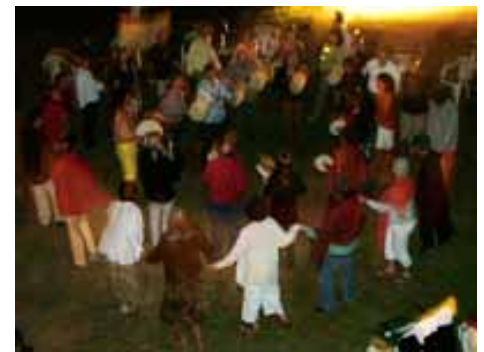
The “clan of big-hoofed animals” Leading the closing ritual of “the evening of expression”.

I do not know if this description of my experiences can be of any help or interest to you. I hope it can. It took the “touch of Tuscany” and the being myself with the being of others to know, that “Being is approaching” - and that you are always here.